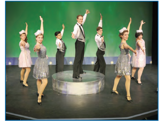
The Cast of 42nd Street (2012)