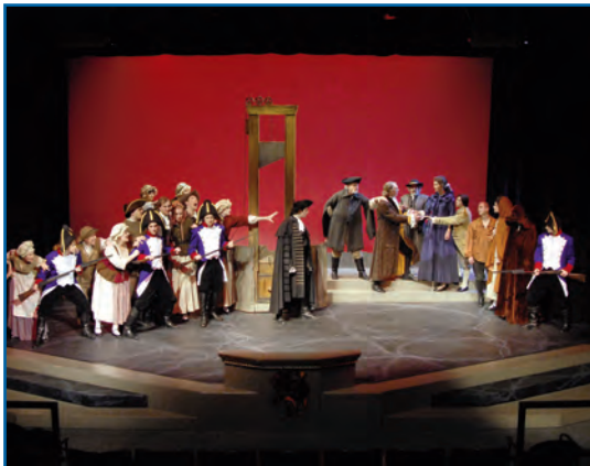
The Cast of The Scarlet Pimpernel (2011)