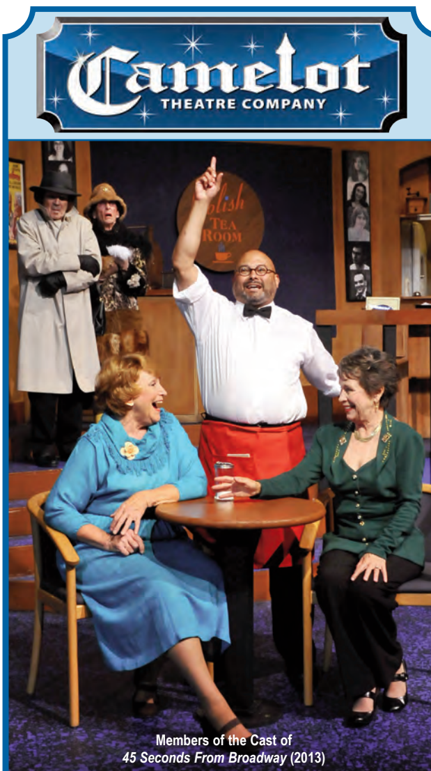
Members of the Cast of 45 Seconds From Broadway (2013)