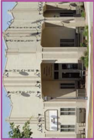
Camelot's new home, the James Morrison Collier Theatre Building