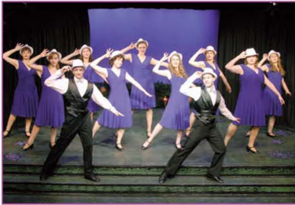
Cast of White Christmas (2010)