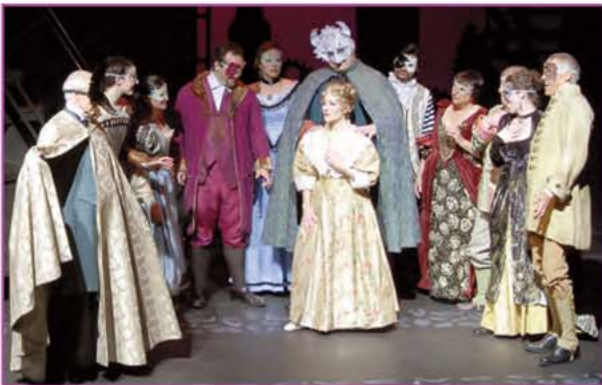
Cast of Sweeney Todd (2011)