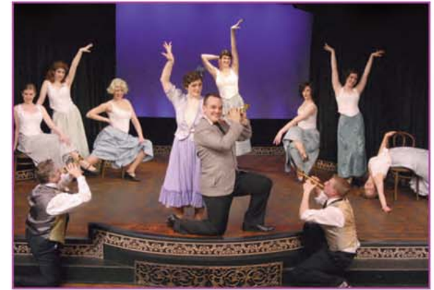
Cast of Funny Girl (2011)