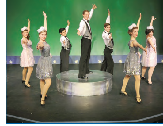
The Cast of 42nd Street (2012)