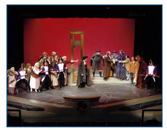
The Cast of The Scarlet Pimpernel (2011)