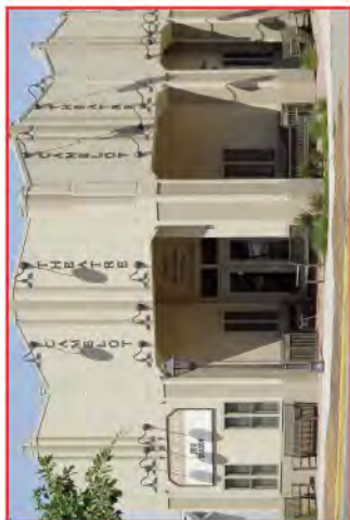
Camelot's home, the James Morrison Collier Theatre Building