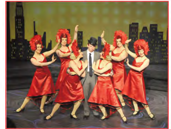
Members of the cast of The Producers (2014)