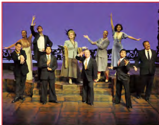
Members of the cast of Evita (2013)